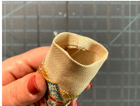
11. Fold & finger press the raw edges of the roll over, approximately \frac{1}{4} ". Make sure that the linen space between the fold & the stitching measures \frac{7}{8} - 1".