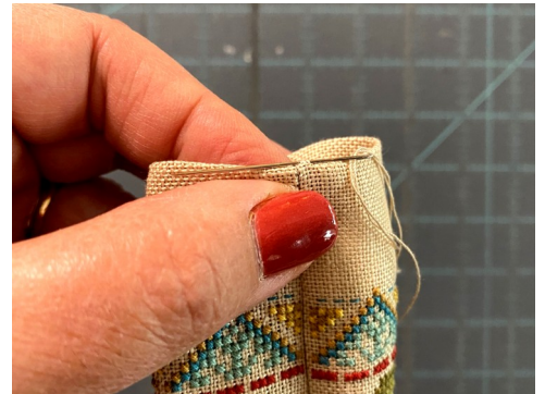
12. Cut a single length of lacing thread. Fold & put 2 ends through chenille needle (for loop method). Secure thread along the fold.