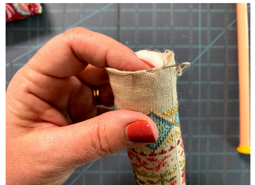
18. Close the open end of the roll as you did in steps 12-14.