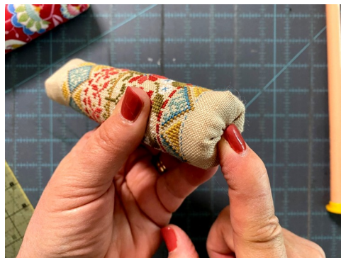
17. Photo shows how we will be flattening the end of the roll with a button. Keep packing the roll with stuffing until it is full.