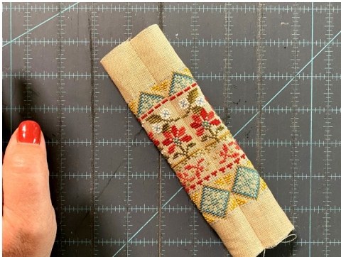
10. Turn roll right side out.

"Spring Roll" ©2025 by Hands On Design, LLC—No part of this publication and/or logo may be reproduced except by needle & thread. HOD patterns & finishing instruction are for personal use only and may not be shared physically or electronically – Please honor the copyright & the designer.