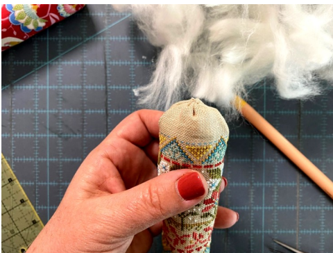
16. Carefully push the roving to the opposite end of the roll. Don't worry about opening up all of the creases & pleats, we will be covering that with a button.