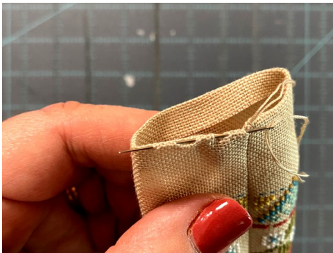
13. Baste stitch around the fold, cinch the stitches as you go to close the end of the tube.