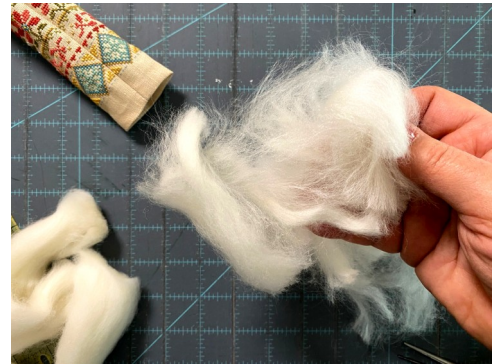
15. Pull the roving/stuffing apart to add loft. Insert in small amounts through the open end of the roll.