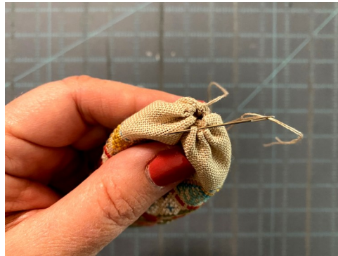
14. Once the basting stitches are cinched, take tiny stitches from side to side to further close the end of the tube. Knot & trim lacing thread.