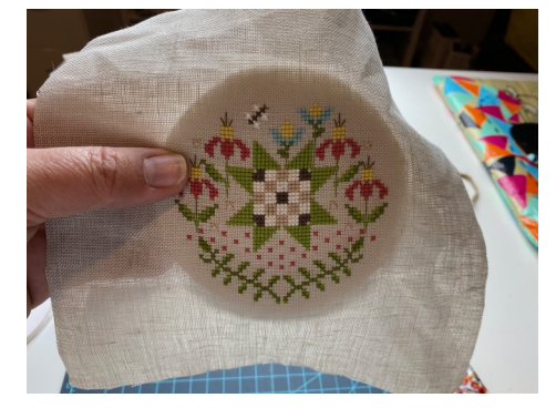
5. Place the stitched piece over the batting layers. Hold the pieces up to a window or light source to help center your stitching.