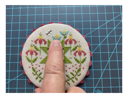
17. You are ready to attach your magnet: place it in the middle of the design, halfway between the center of the circle & the top edge. (where my finger is pointing.)

Mark that spot with a pen. Place a dab of the E6000 on the marked spot & place a magnet in the glue. (Test your magnet before you apply the glue to make sure it faces the correct direction to stick to the chalkboard round).