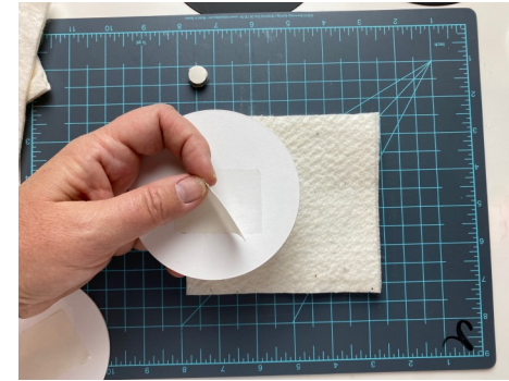
2. Place a small piece of Double Sided (DS) tape on one side of the 3 round mat boards. (It is OK to proceed without DS tape. You will need to make sure your batting doesn't move too much as you start to lace).