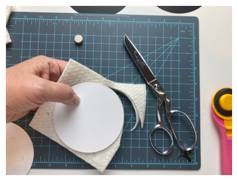
3. Cut both layers of batting to fit the round mat board. Leave a scant bit of the batting showing beyond the edge of the mat board.