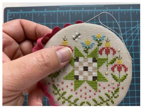
15. Be sure to check the front of your work often to make sure that your rick rack is well placed.