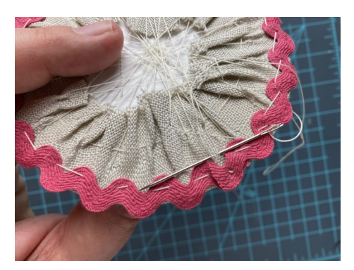
16. As you reach the end of the circle, trim the rick rack in another valley. Overlap a small amount from where you started. Tack the end in place as you did the beginning. Run the needle through the linen & knot.

18. Find that same spot on the back of your piece (you can also see what the back of the finished piece will look like).