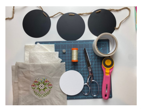
1. Gather the items in your club kit (3 round mat boards, batting, 2 magnets, E6000, chalkboard rounds, rick rack, needle & lacing thread). Grab other finishing basics: scissors, iron, cutting mat, double sided tape if you have some.

Now that you have Gathered your Wildflowers (or whatever seasonal delight we will focus on), let's get finishing so you can display & be proud of what you created! Cathy