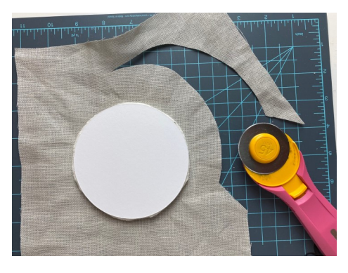
5. Once you have you stitching centered, place the linen, right side down, onto a cutting surface. Trim the linen 1" to 1.25" away from the mat board with scissors or rotary cutter.