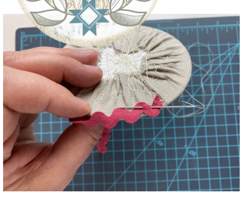
14. This photo gives you a better idea of what your basting stitching will look like as you attach your rick rack.

Gather Round Finishing Tutorial ©2023 by Hands On Design, LLC—all images & instruction are for personal use only and may not be shared physically or electronically—please honor the copyright & the designer. Please support our industry.